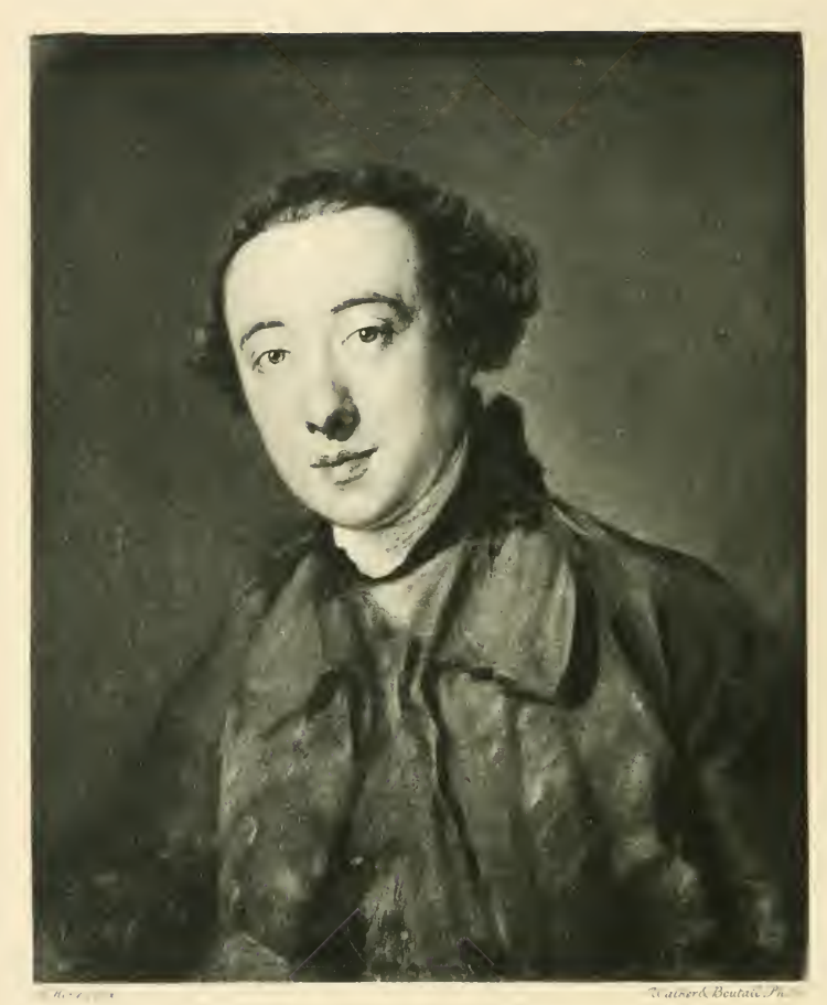
The Hon Horace Walpole.